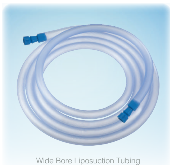
Wide Bore Liposuction Tubing