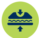
High Fluid Retention