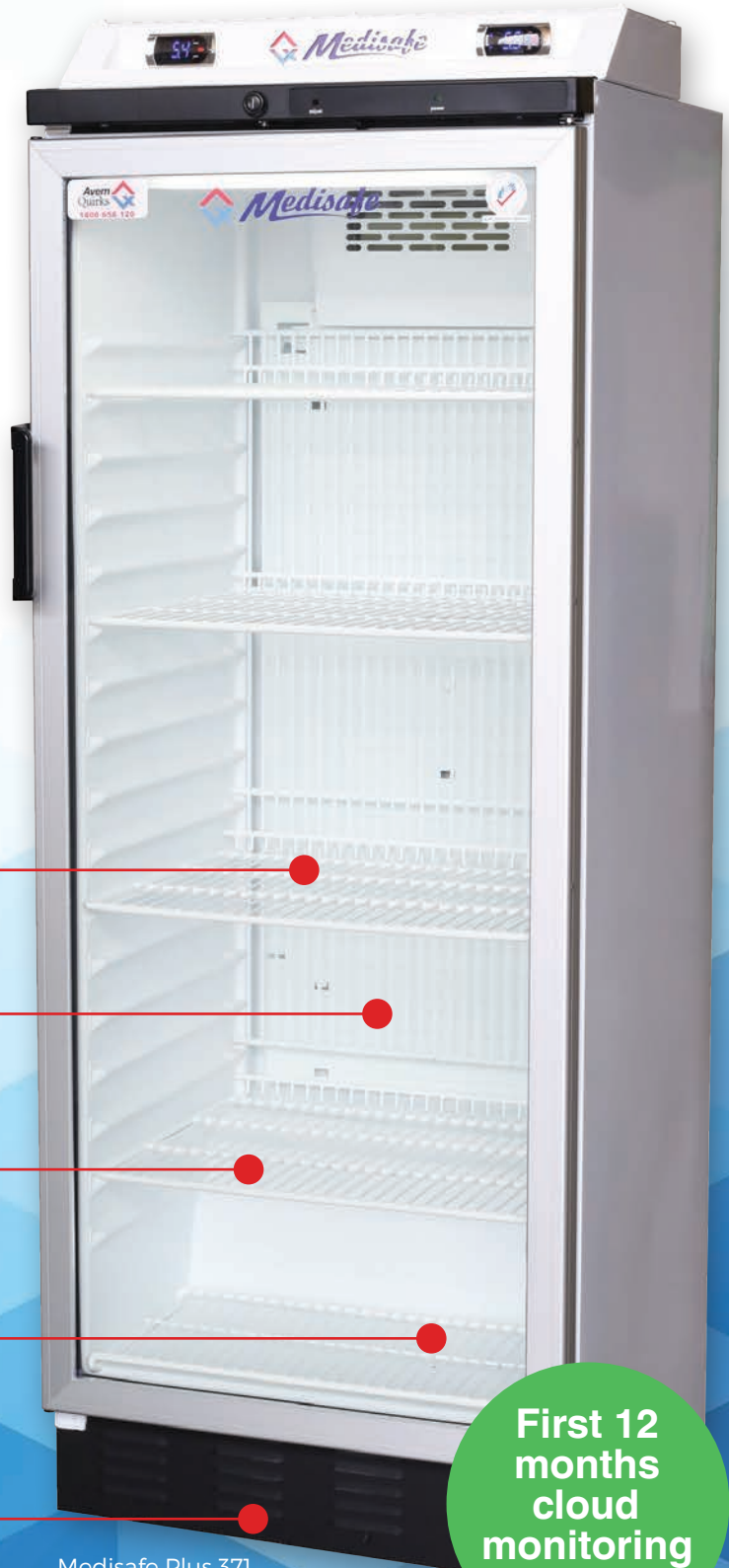
Medisafe Plus 371