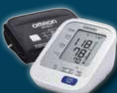
Premium Blood Pressure Monitor DAHEM7322