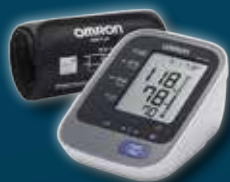
Ultra-Premium Blood Pressure Monitor DAHEM7320