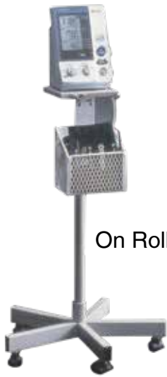
On Roller Stand