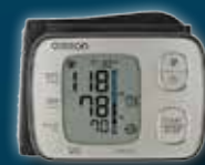
Premium Wrist Blood Pressure Monitor DAHEM6221

For more information visit www.omronhealthcare.com.au