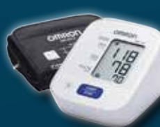
Standard Blood Pressure Monitor DVSEM7121