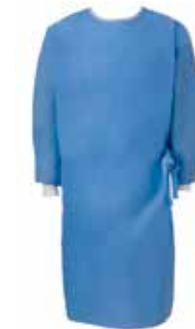
Astound® Poly-Reinforced Gowns