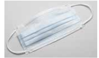
31050009 Insta-Gard® Surgical Mask