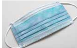
31050020 Secure-Gard® Surgical Mask with fog-free foam