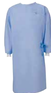
SmartGown™ Surgical Gowns