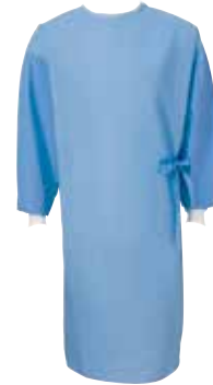
Astound® Standard Surgical Gowns