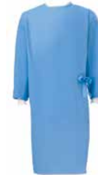
Astound® Fabric-Reinforced Gowns